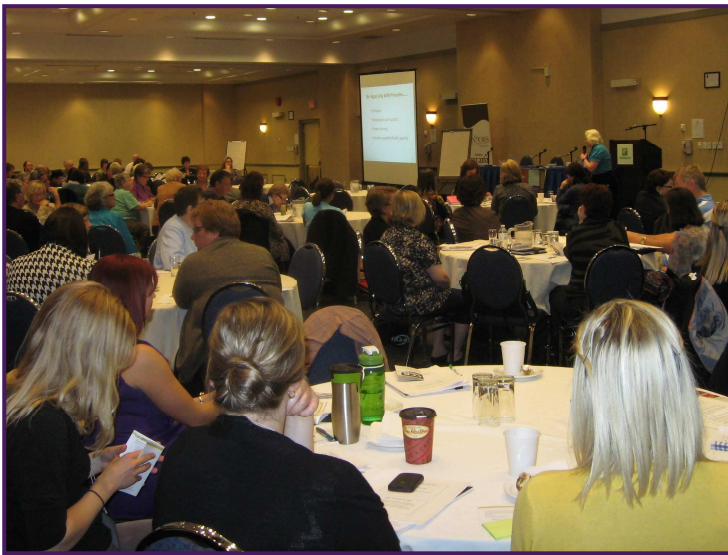
One of the educational sessions at the symposium

Based on this input, the Network Steering Committee is developing a strategic plan for the Network. This will be introduced at a future NLNPEA meeting and made available on our website once it is completed.