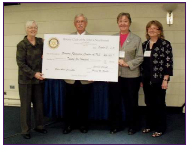
A cheque presentation at the symposium from the Rotary Club of St. John's Northwest. This generous donation will enable the Network to develop a virtual resource to help prevent elder abuse.